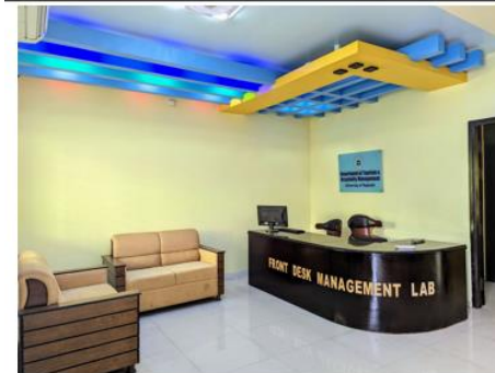
Hotel Management lab